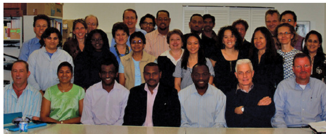
Participants at the 13th TB/HIV Core Group Meeting