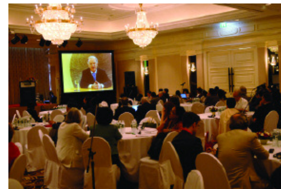
UN Special Envoy to Stop TB, President Jorge Sampaio addressing the session via video conference

The UN Envoy to Stop TB, former President Jorge Sampaio, addressed the thematic session via video conference and called on participants to exhibit bold leadership at all levels to keep both TB and HIV high on political and development agendas. In this context, he highlighted the upcoming HIV-TB Leaders' Forum on the 9 June, ahead of the High-Level Meeting on HIV/AIDS, in New York.