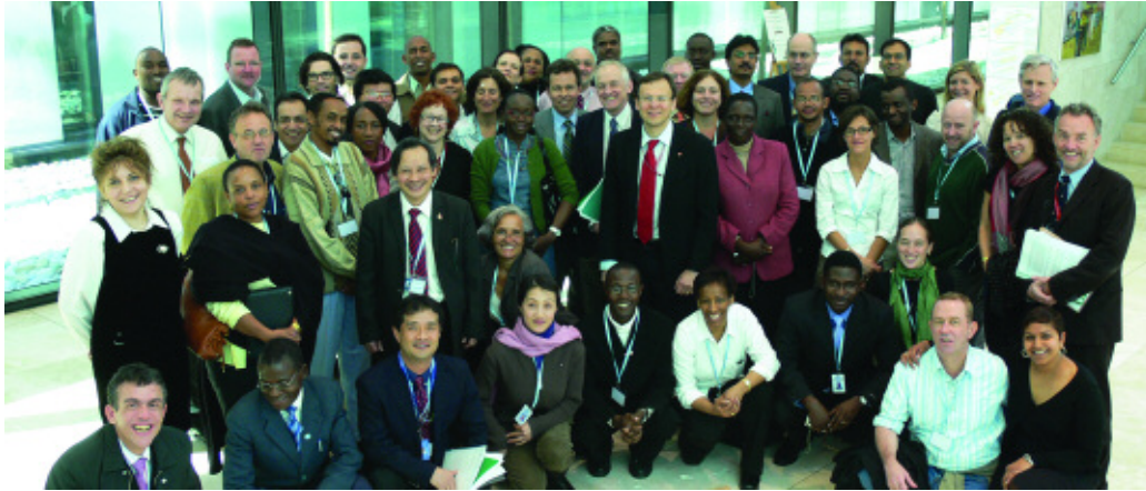
Participants at the Three Is meeting, Geneva, Switzerland

Sixty-five experts from the HIV and TB communities came together in Geneva, Switzerland from April 2-5, 2008 for the "Three Is" meeting on those 3 interventions that reduce the burden of TB in PLHIV - infection control, intensified case finding, and isoniazid preventive treatment (IPT). Participants were asked to review their program experience, available data on the three interventions and develop guidance for national programs and their partners for implementation of the Three Is for people living with HIV.