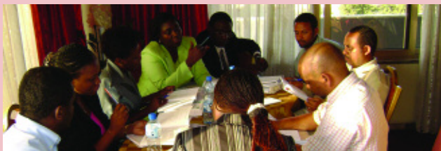
Participants at the IMAI/STB TB/HIV co-management training workshop, Addis, Ethiopia

An international workshop was held by WHO in Addis Ababa, Ethiopia from February 11-13, 2008 to facilitate country adaptation of the new IMAI/STB TB Care with TB-HIV Co-management clinical guideline module and the clinical training courses on TB-HIV co-management and TB infection control for primary facilities.