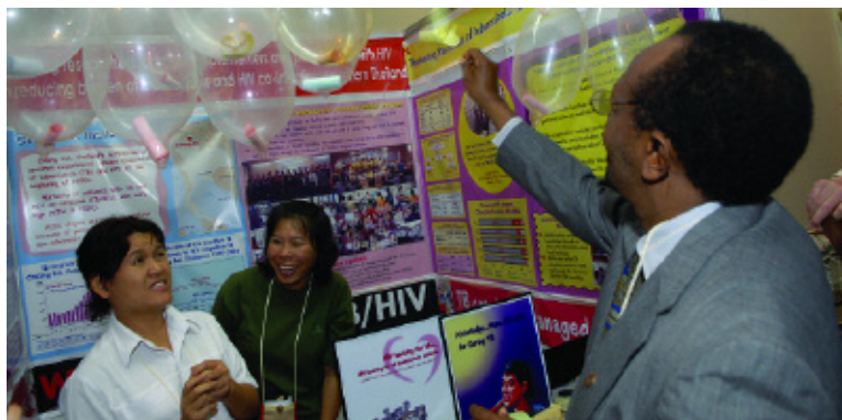
The marketplace provided an opportunity for groups to share their experiences in collaborative activities scale up