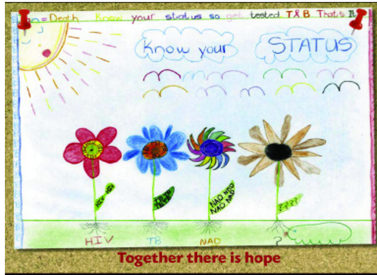
Winners of the 2008 calendar art competition

have been enrolled in HIV/TB care of which 3175 are currently enrolled on ART. The program roll-out started in the North West province and has now added two more provinces (Eastern Cape and Western Cape) to their list, supporting more than 80 clinics in 5 sub-districts. This is apart from supporting eight TB referral hospitals in the Eastern Cape.