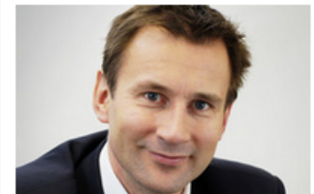
Secretary of State for Health, Rt Hon Jeremy Hunt MP