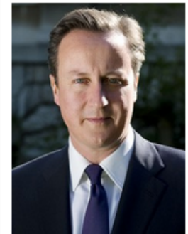
Prime Minister, David Cameron

"Genomics England will provide the investment and leadership needed to dramatically increase the use of this technology and drive down costs."