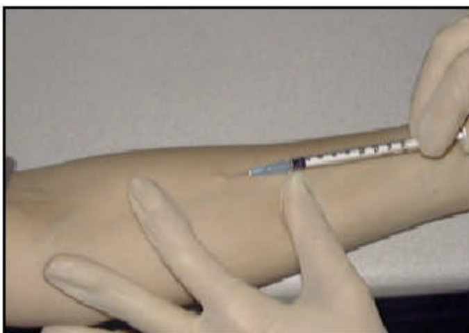
Figure A1.1 Administration of the tuberculin skin test using the Mantoux method