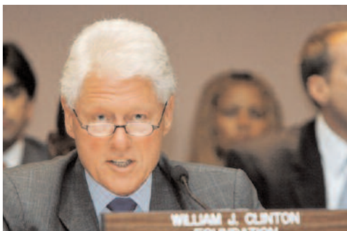
President William J Clinton presenting at the Forum

Speakers called for specific interventions to reduce the burden of TB among people living with HIV, the so called Three Is for HIV/TB, (isoniazid preventive therapy, intensified case finding for TB, and infection control), should be implemented by all HIV services as a matter of urgency. This involves early diagnosis and treatment of TB if it is present, and, if it is not, TB preventive treatment with isoniazid.