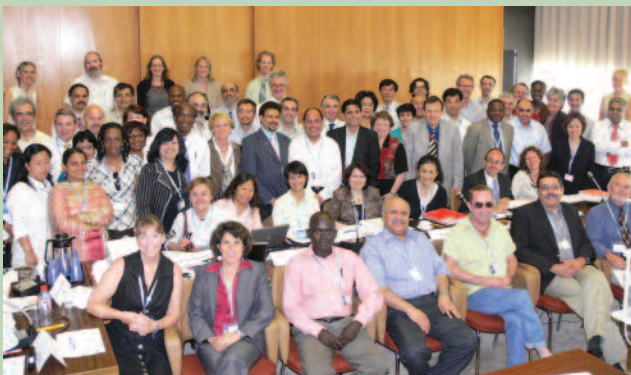
Participants at the STAG meeting, Geneva, Switzerland