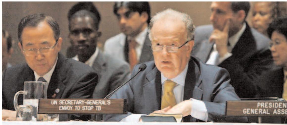
UN Secretary General Ban Ki-moon and UN Special Envoy to Stop TB, Former President of Portugal, Jorge Sampaio