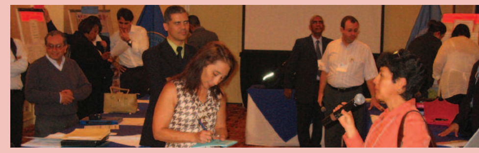
Participants at the TB/HIV workshop, San Jose, Costa Rica

The WHO Americas region held a series of TB and HIV meetings in San José, Costa Rica, in November. The meetings brought together TB and AIDS program managers, counterparts and PAHO's regional advisers and teams who discussed progress in implementing TB/HIV collaborative activities with emphasis on the 3 Is (those measures that reduce the burden of TB in PLHIV). Previously an HIV meeting was held to analyze the challenges and opportunities for the health sector to reach the Universal Access Goals by 2010. A separate meeting of TB managers and heads of health services of correctional facilities to discuss TB in prisons was also held, with a special session on TB/HIV.