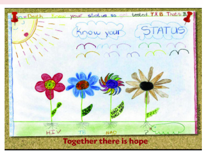
Winners of the 2008 calendar art competition

have been enrolled in HIV/TB care of which 3175 are currently enrolled on ART. The program roll-out started in the North West province and has now added two more provinces (Eastern Cape and Western Cape) to their list, supporting more than 80 clinics in 5 sub-districts. This is apart from supporting eight TB referral hospitals in the Eastern Cape.