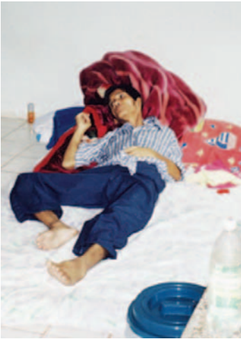
Before TB treatment