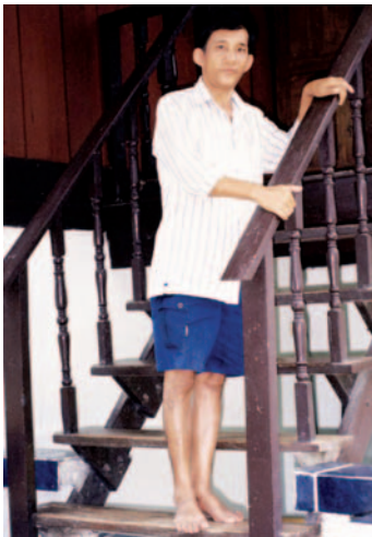
After 3 months of TB treatment