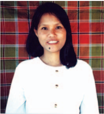
Photo after completing TB treatment