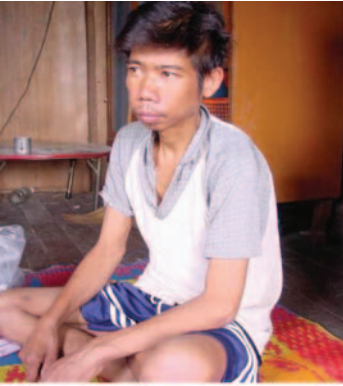
Before TB treatment