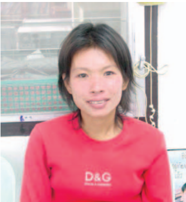
After TB treatment