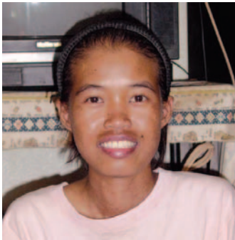
After completing the treatment