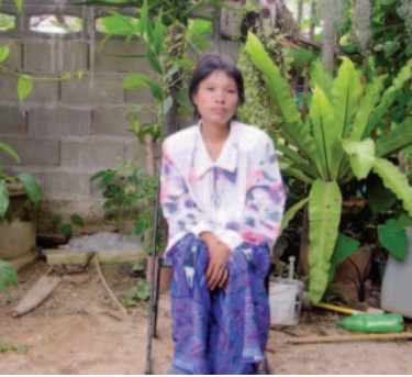
Before TB treatment