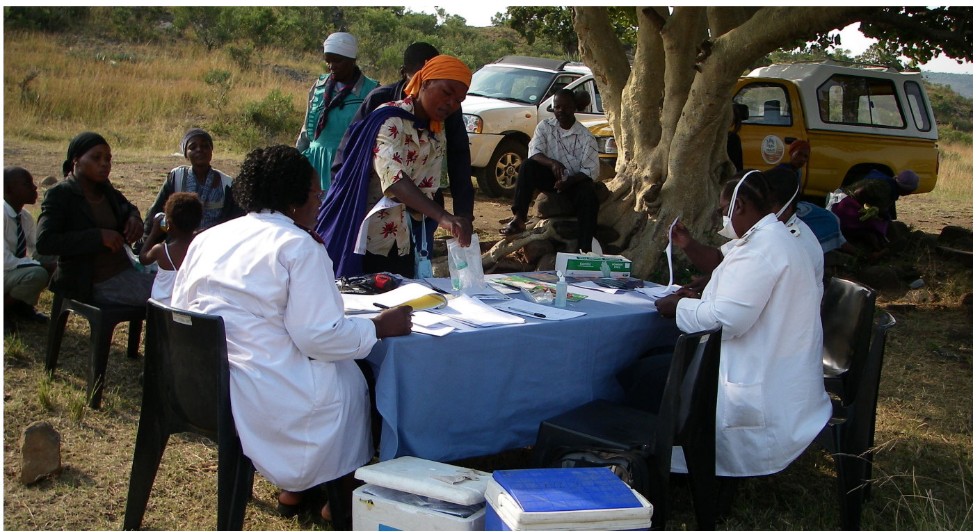
Philanjalo, South Africa