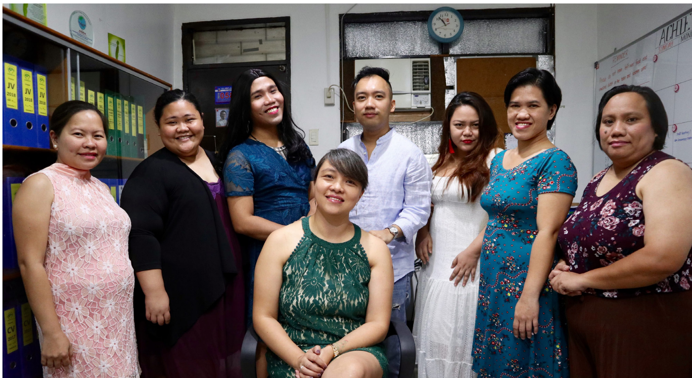
Action for Health Initiatives, Inc, Philippines