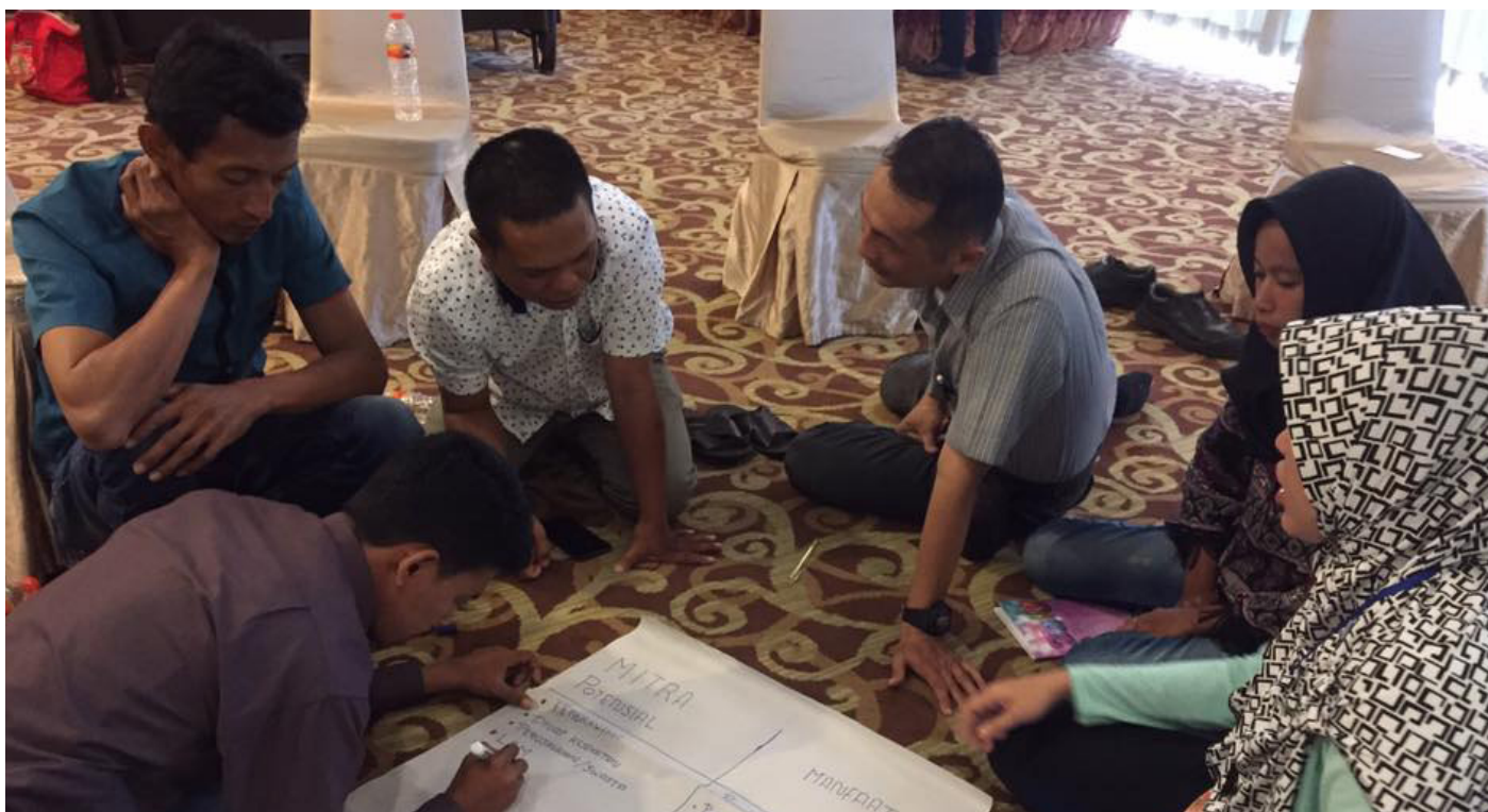
Yayasan KNCV, Indonesia