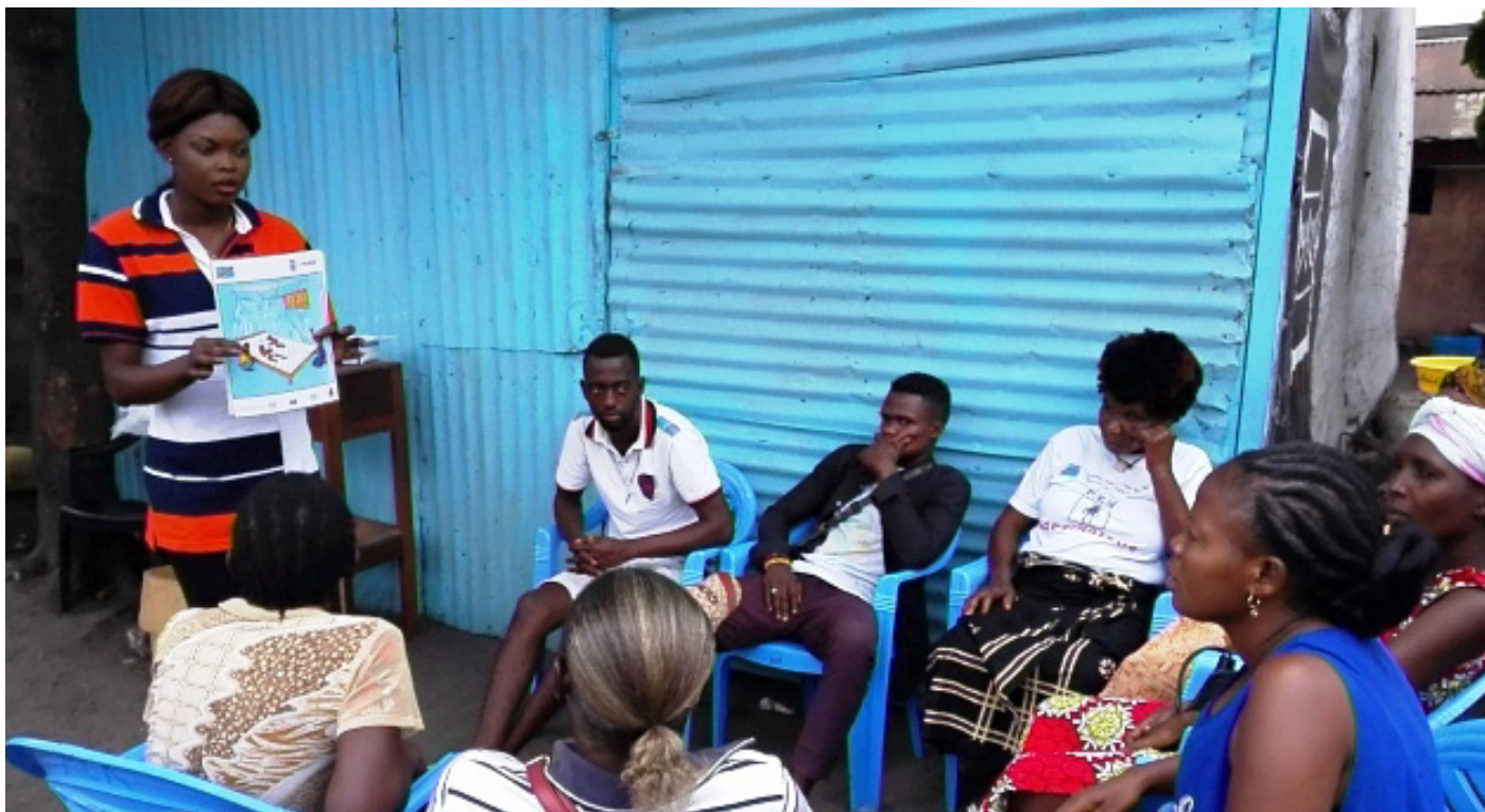
Humana People to People, DRC