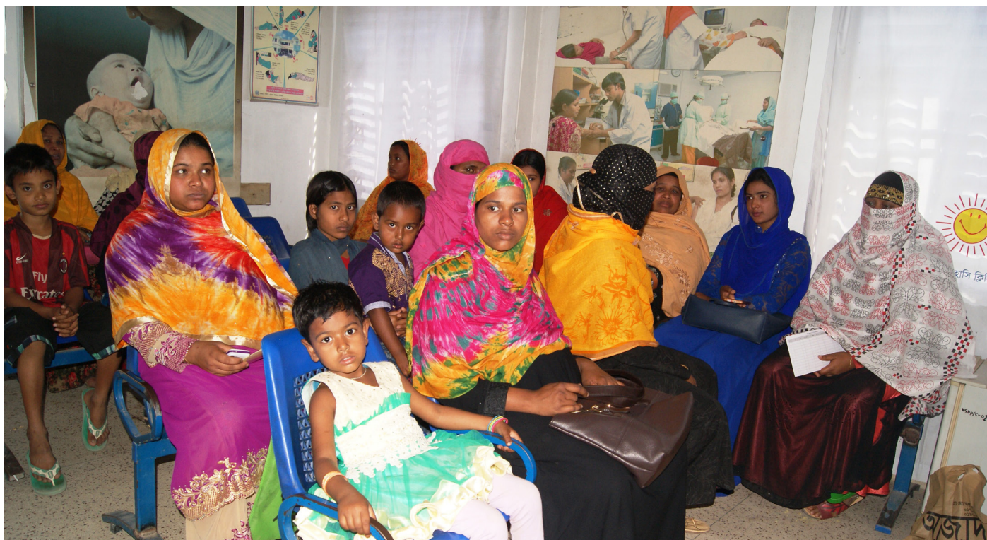
Tilottama Voluntary Women's Organization, Bangladesh