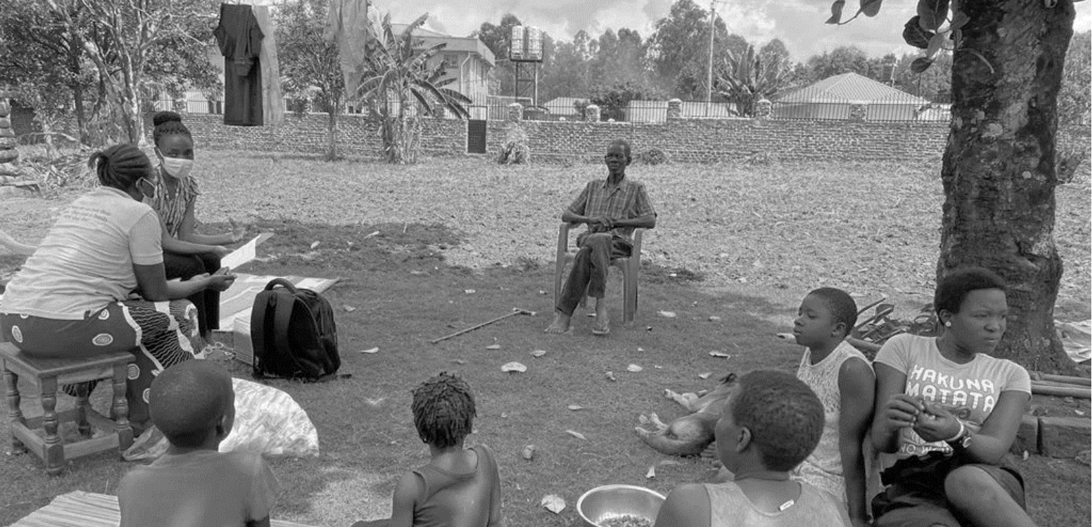
Contact tracing in village.