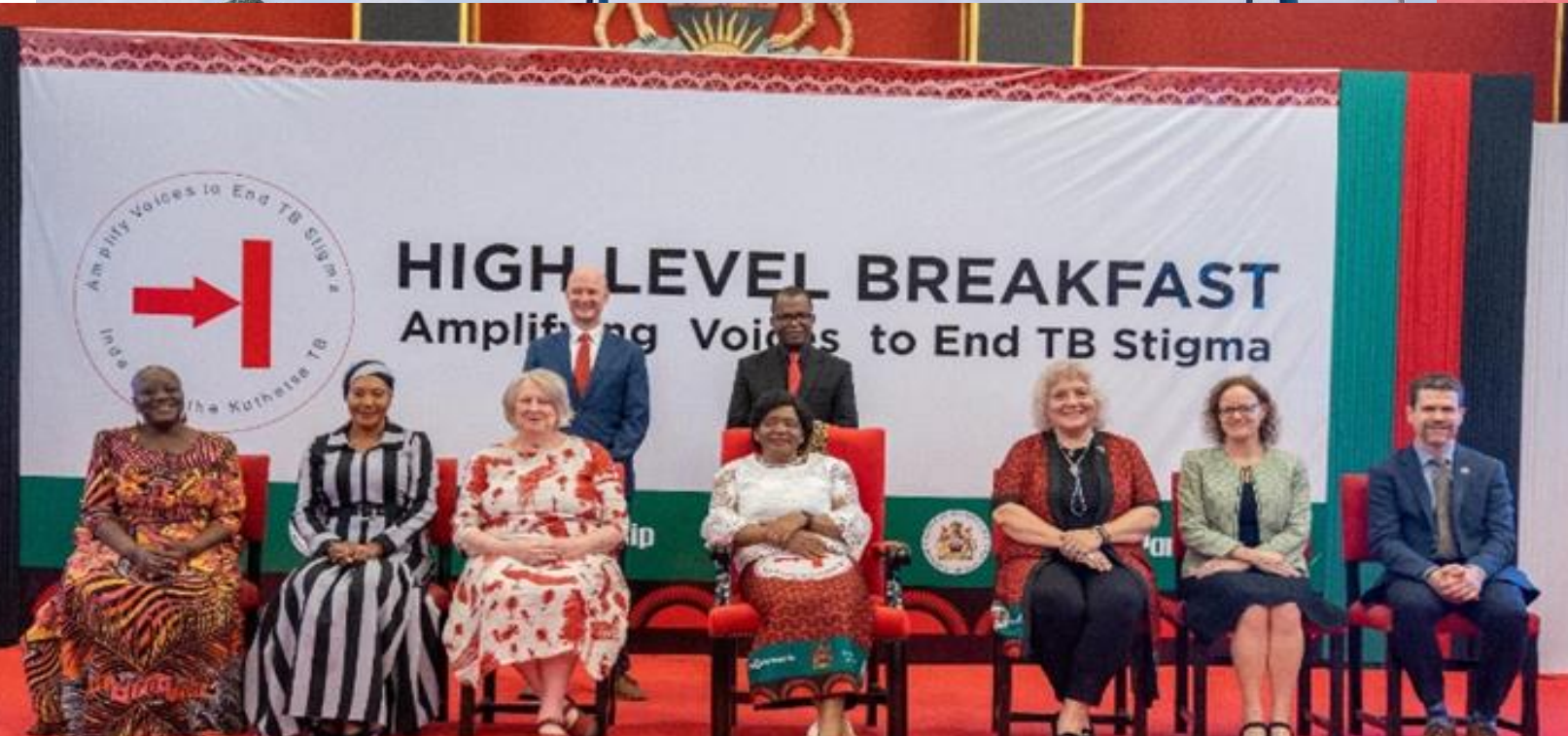
High Level Political Leadership in Malawi