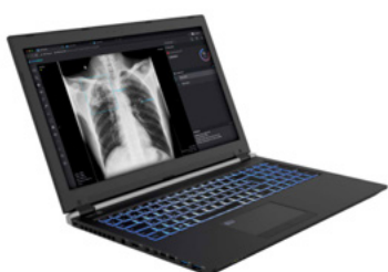
(Laptop to be procured separately)