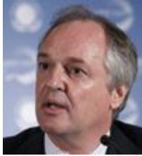
Paul Polman (Netherlands)