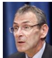
Andris Piebalgs (Latvia)