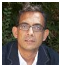
Abhijit Banerjee (India)