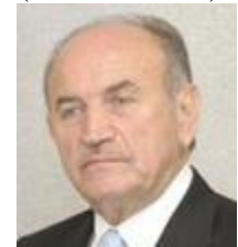
Kadir Topbaş (Turkey)