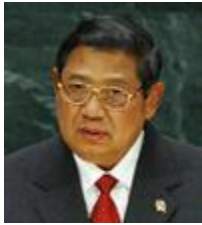
H.E. Mr. Susilo Bambang Yudhoyono, President of Indonesia Co-Chair