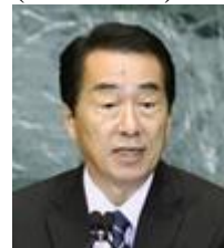
Naoto Kan (Japan)