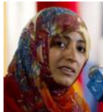
Tawakel Karman (Yemen)