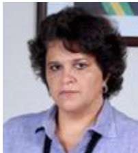
Izabella Teixeira (Brazil)