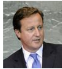
H.E. Mr. David Cameron, Prime Minister of the United Kingdom Co-Chair