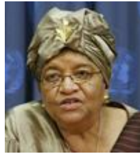
H.E. Ms. Ellen Johnson Sirleaf, President of Liberia Co-Chair