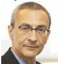
John Podesta (United States of America)