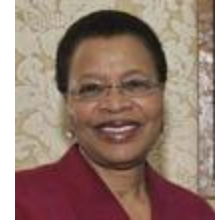
Graça Machel (South Africa)