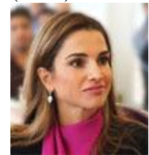
H.M. Queen Rania of Jordan (Jordan)