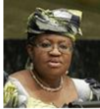
Ngozi Okonjo-Iweala (Nigeria)