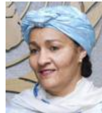
Amina J. Mohammed (ex officio)