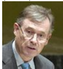
Horst Kohler (Germany)