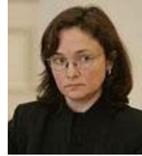
Elvira Nabiullina (Russian Federation)