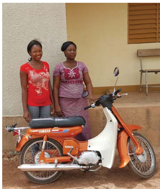
Health center staff in Burkina Faso. [Source: Kameko Nichols, Independent Consultant, ASLM].

Other similarities in the specimen referral systems were the fragmentation and lack of coordination across specimen types and disease programs, lack of communication and transparency among stakeholders, and lack of mapping out various systems. Another notable difference between countries was the engagement of various government and private sector stakeholders. In Mali and Burkina Faso, for instance, the national postal system is quite strong and has the ability to potentially transport specimens, although there was no current engagement in this area. In Cote d'Ivoire, however, the national postal system was not as viable as a potential service provider for specimen transport due