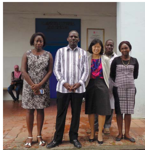
Outside the National Public Health Laboratory in Cote d'Ivoire. [Source: Kameko Nichols, Independent Consultant, ASLM].