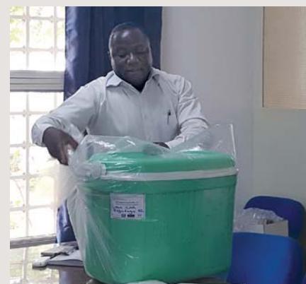
Sonapost showing how the post packages its shipments.

Phase II – Design. Under the Global Health Security Agenda and during the transition to phase II of the project, Burkina Faso was focused on strengthening surveillance for severe acute respiratory infections, which generates specimens requiring transport to the National Influenza Reference Laboratory (Laboratoire National de Référence pour les Gripes, LNR-G). Design of a pilot system for severe acute respiratory infections samples was undertaken by performing primary research and interviews at multiple levels of the health system, including the primary health center, district laboratory, LNR-G and central Ministry of Health levels. Key partners, including the consultant, ASLM, CDC