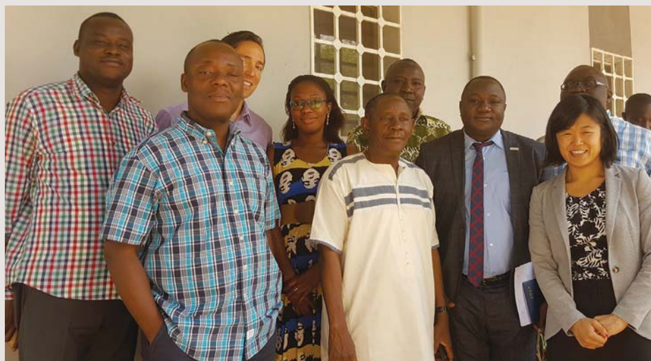
The team from CDC-Burkina Faso, Davycas, Sonapost and ASLM.