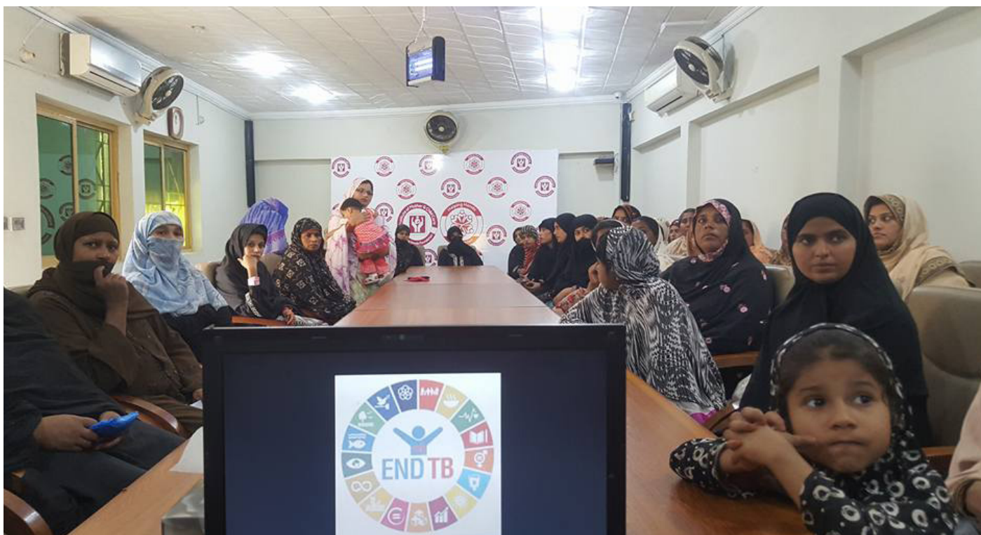
Helping Hands Foundation, Pakistan