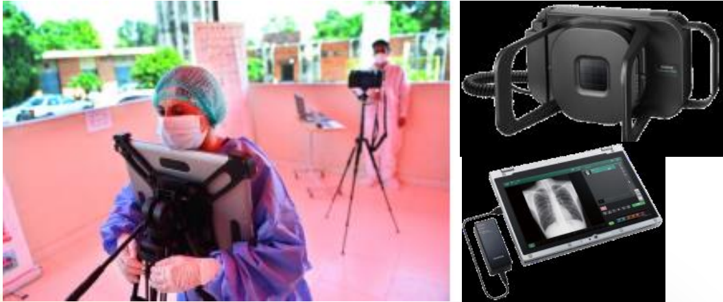
Ultraportable Xray with CAD, being used in Pakistan