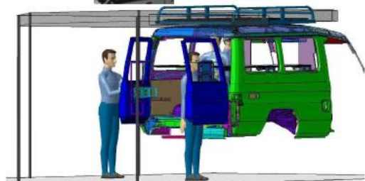
X-ray & Panel can be hold at the rear door

4 passengers can be on board in a car, Ex) Radiographer x 1, LAB tech x 2, Driver x 1