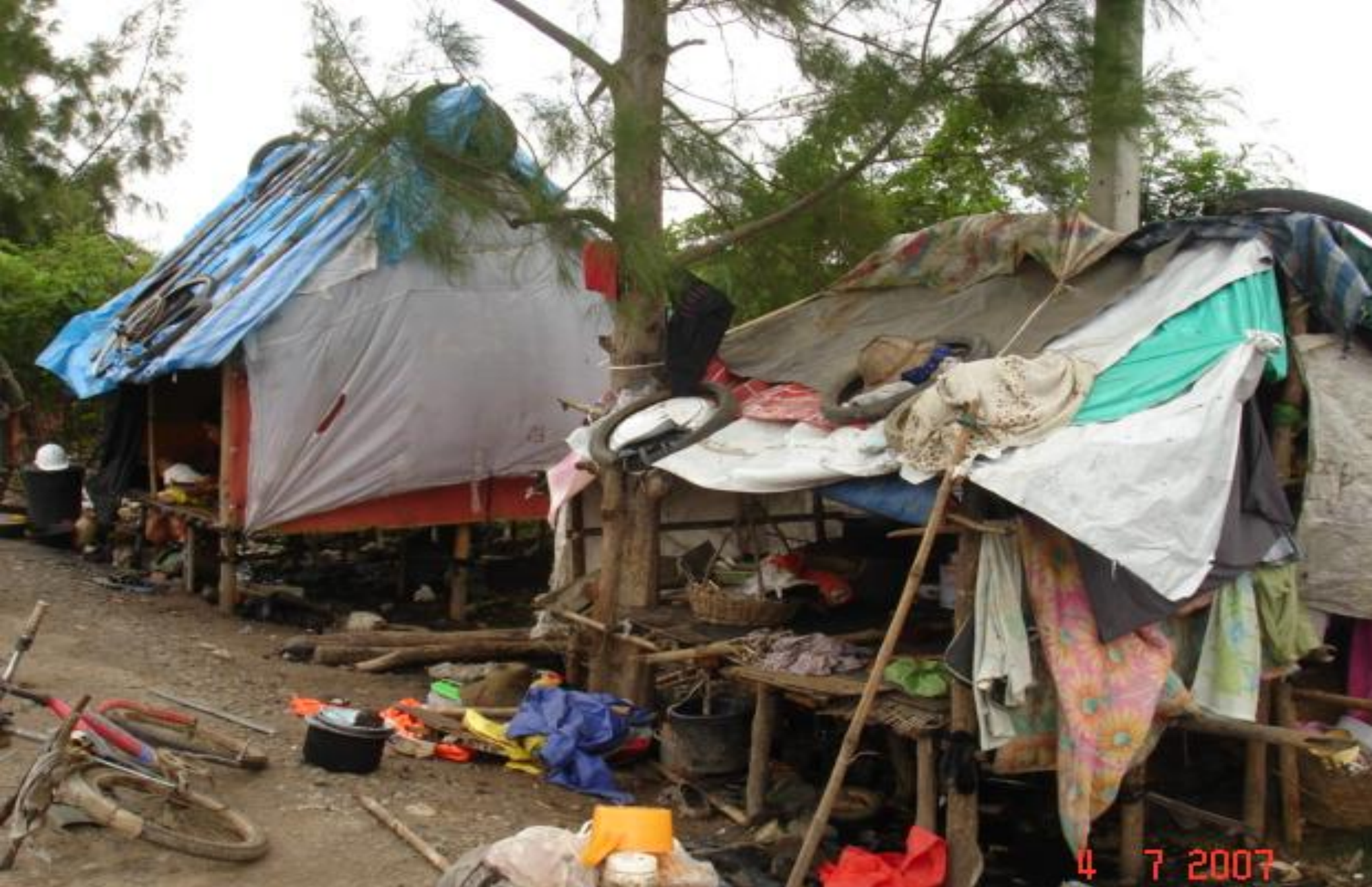
Harsh living condition of migrant community in Maesot, Tak