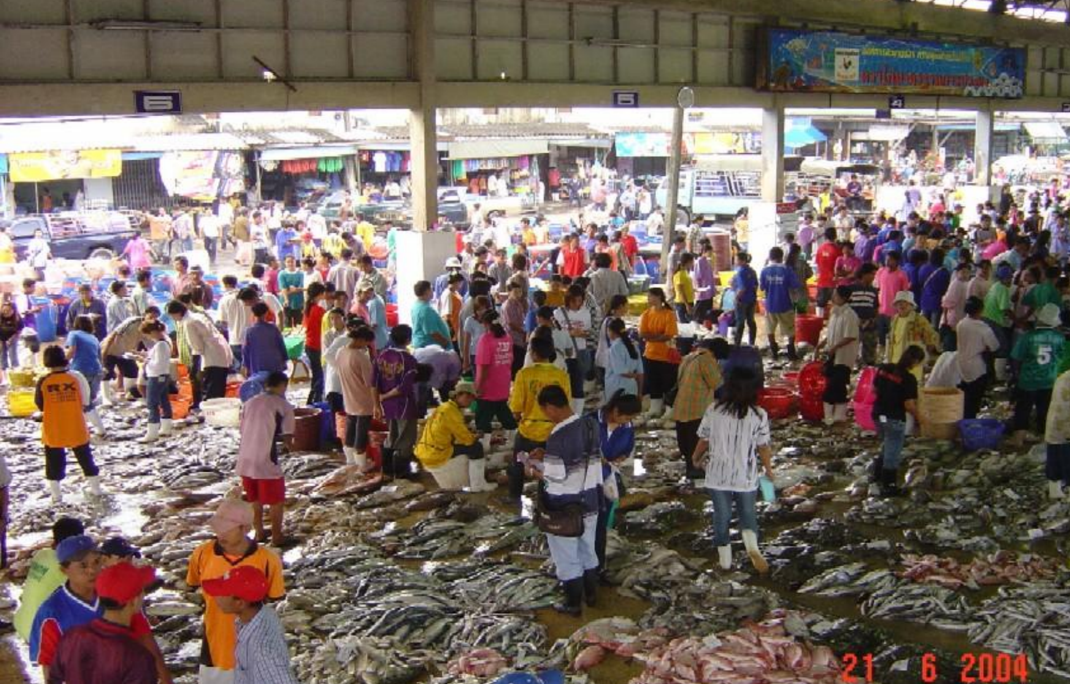
Migrants working in a Fishing Pier, Ranong