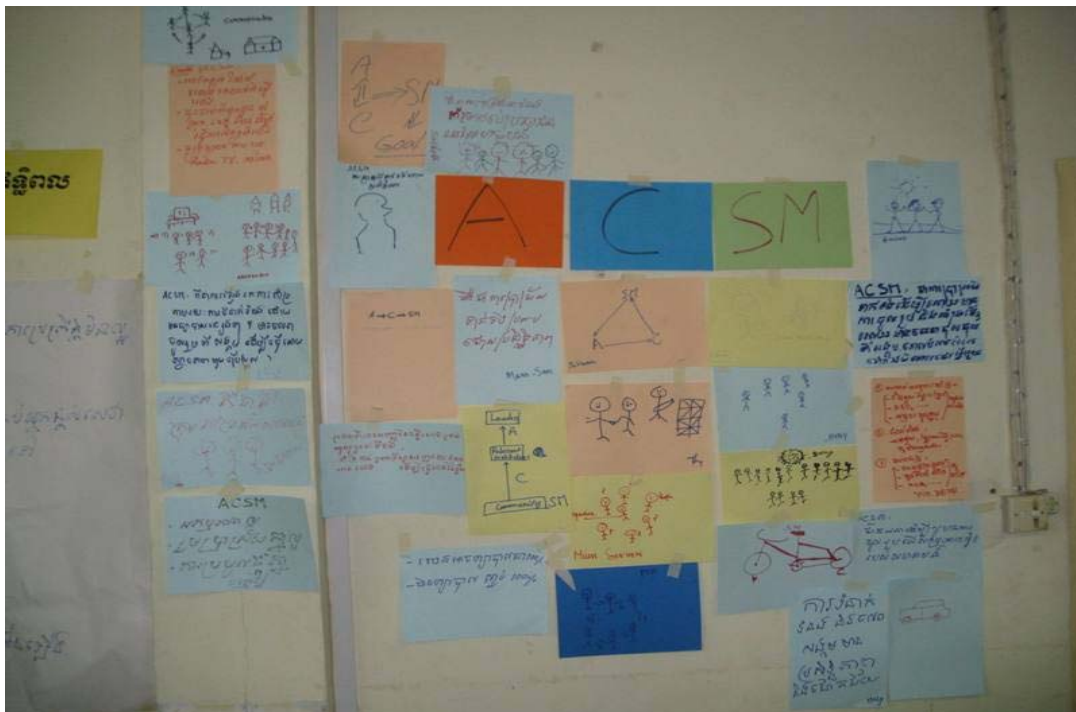
Result of the brainstorming exercise. Participants were asked to describe in anyway they wanted what ACSM meant to them.