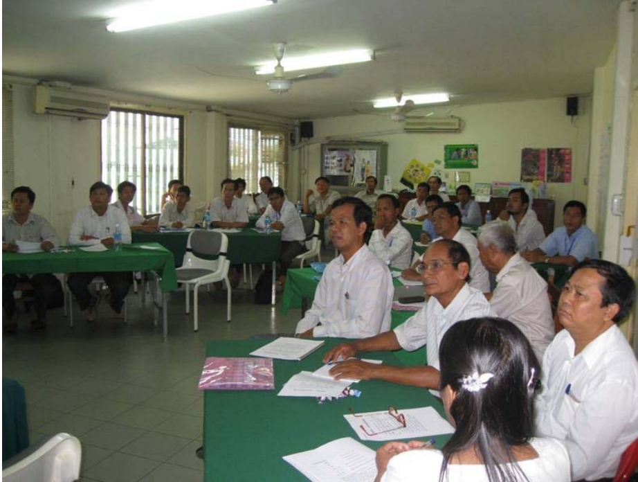
Participants were very interested in all the sessions. In the background you can see the ACSM gallery corner which was a display of materials participants have used in their programs and brought in for show and tell.