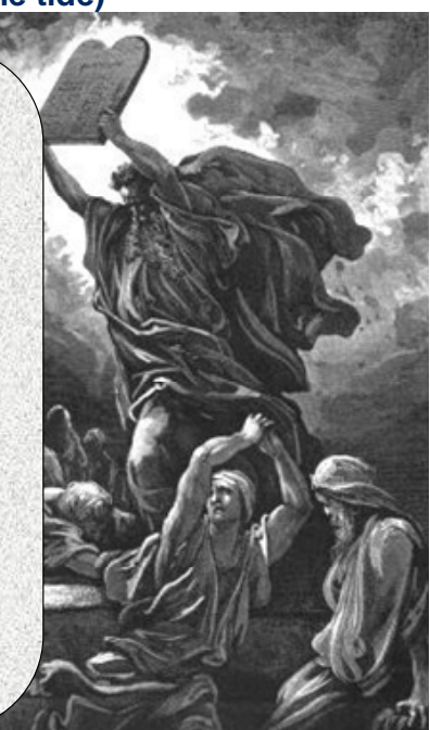
McKinsey & Company | 32

The first three assumptions reflect the necessary commitment of international organisations to engage with all countries trying to scale up MDR-TB management, to help them with their challenges —even if these countries are not currently pursuing the 'most technical correct' scale-up approaches, and to try to guide them towards better and better MDR-TB management. While this is, on one level, uncontroversial and clear, there was a view amongst some participants that this was not how international support was currently perceived by countries: categorization