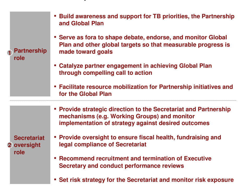
Exhibit 1: Role of the Partnership Board

Given this role, the Steering Committee identified the key decisions the board should be taking against six governance functions: strategy, performance, financial, governance, risk and advocacy.