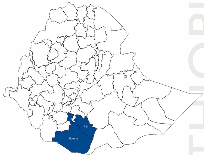
Figure 1. Map of Ethiopia showing Guji and Borena Zones

After the phase out of successful and comprehensive support by HEAL TB in April 2016, MSH's TB program support continued under USAID's Challenge TB project, which focuses on addressing key population groups. The interventions initiated in the informal mining areas continued to be priorities both for partners and the National TB Program (NTP).