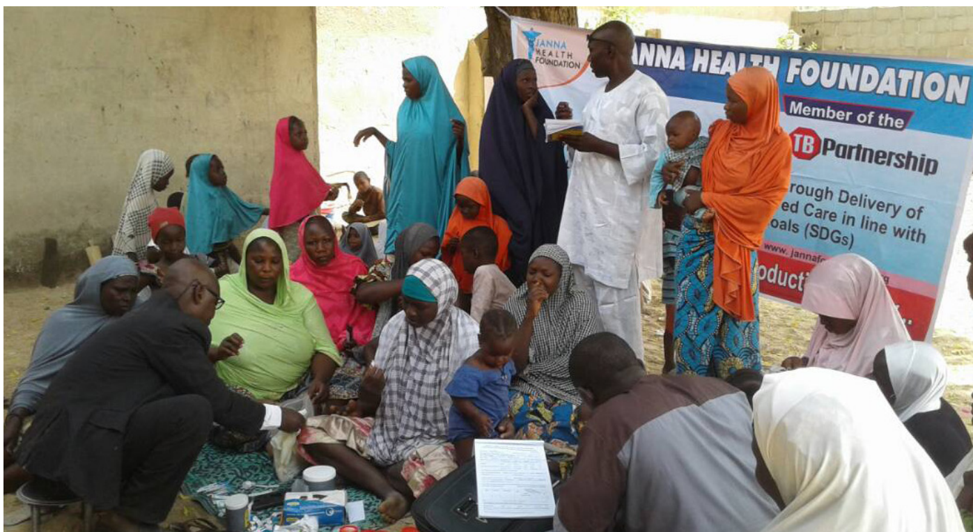
Janna Health Foundation, Nigeria