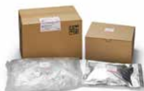
Loopamp™ PURE DNA Extraction Kit