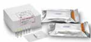
Loopamp™ MTBC Detection Kit